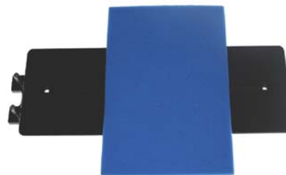
Rotated Base Pad is perpendicular to the ULP base plate