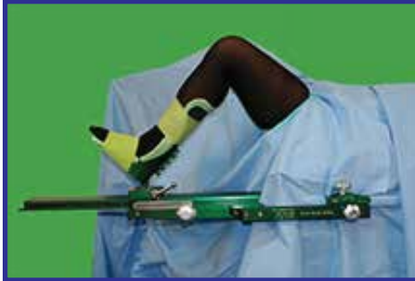
De Mayo V 2 E™ Knee Positioner

◆ When utilizing the Sterile Extension, the surgeon can stand between the legs of the patient for greater access approaching the medial compartment.