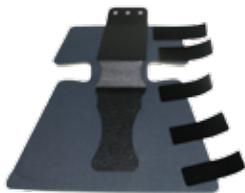
Phase 4 Gel™ Splint

RoTractor® has 3 connector posts matching the hole configuration of the Phase 4 Gel™ Splint for maximum security.