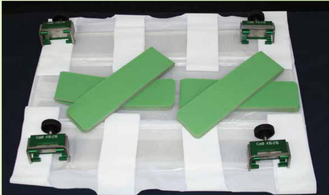
Illustrated Complete Set Up: Estape TrenMAX® Pad, 4 each Estape TrenMAX® Clamps

Designed to meet AORN recommendations in "Recommended practices for positioning the patient in the perioperative practice setting" to prevent tissue injury and ischemia that may be caused by tucking a patient's arms at his or her side.